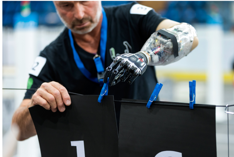
Fig. 2 Pilot with a powered arm prosthesis performing a daily living task. Picture was taken at the Cybathlon rehearsal in July 2015. The pilot on this image as consented to the publication of this image

accepted by physicians and patients for daily clinical routine [12].