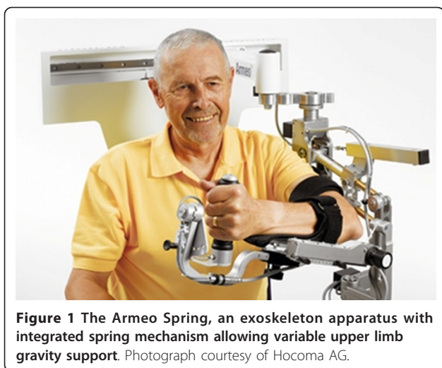
Figure 1 The Armeo Spring, an exoskeleton apparatus with integrated spring mechanism allowing variable upper limb gravity support.

spring mechanism. This enables patients, using residual upper limb function, to achieve a larger active range of motion (ROM) within a 3-dimensional workspace than is possible without support [26]. The integration of a pressure-sensitive handgrip additionally allows the execution of graded grasp and release exercises. Through instrumentation of built-in position sensors and software, the Armeo Spring can be engaged as an input device for the accomplishment of meaningful functional tasks (e.g. cleaning a stove top) that are simulated in a virtual learning environment on a computer screen, with the provision of auditory and visual performance feedback during and after practice.