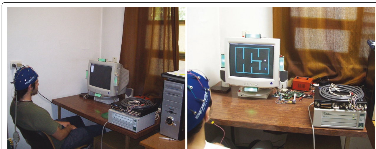
Figure 1 EEG acquisition equipment and lights on the sides of monitor. Left image: A subject using the SSVEP-based BCI. Right image: acquisition equipment and monitor displaying the difficult scenario.

The purpose of this step is to evaluate the performance of the proposed interface in a controlled experiment, since in the next step (asynchronous control) the subject